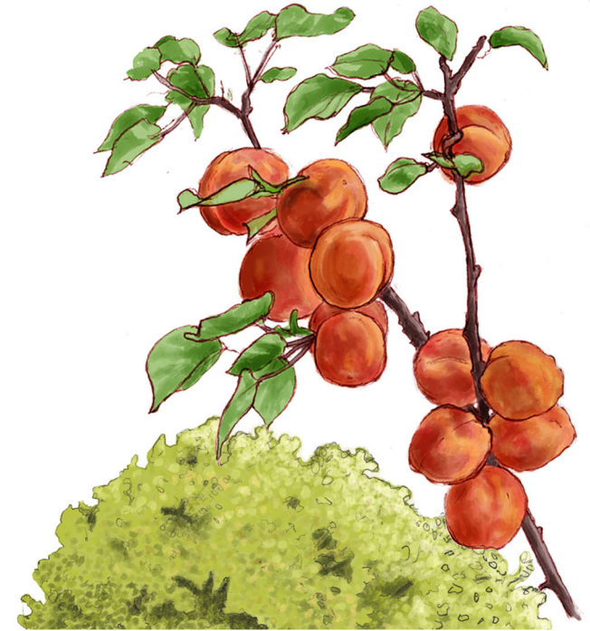
Apple of Gold

It's possible that the fruit mentioned in Genesis 2:9 was an apricot. Apricots were often referred to as 'apples of gold'.