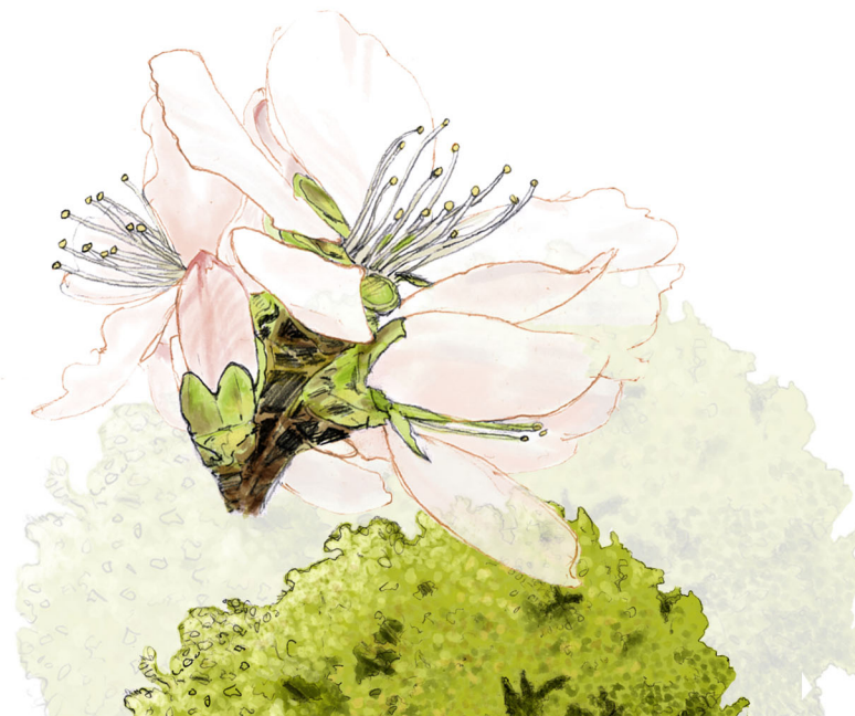
Apple of Gold

Lord, Jesus Christ we thank you for being with us, for teaching, inspiring and guiding us. Help us listen to you in the silence of our being Help us to bring your love and light out into the world, to whomever we meet and especially those we have difficulties with. God, Divine Creator, Mother, Father, we ask you to bless our world at this time and we thank you for it. We pray and thank Mother Earth for her beauty and nurturance in the knowledge there would be no life without her. We thank all the angels, the saints and our spiritual helpers who are always there to help us on our journey. Thank you, God. Amen