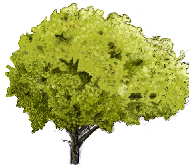
Apple of Gold

It's possible that the fruit mentioned in Genesis 2:9 was an apricot. Apricots were often referred to as 'apples of gold'.