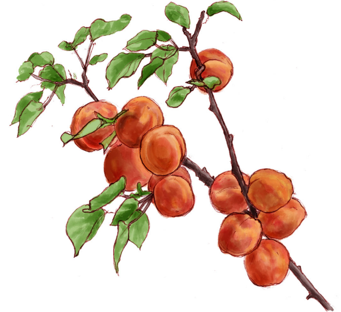
Apple of Gold

It's possible that the fruit mentioned in Genesis 2:9 was an apricot. Apricots were often referred to as 'apples of gold'.