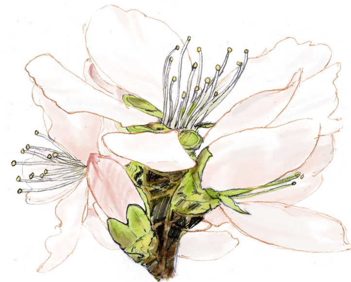
Apple of Gold

It's possible that the fruit mentioned in Genesis 2:9 was an apricot. Apricots were often referred to as 'apples of gold'.